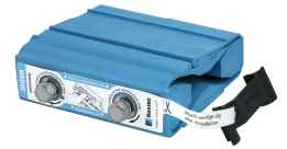
Wedge & Wedgekit